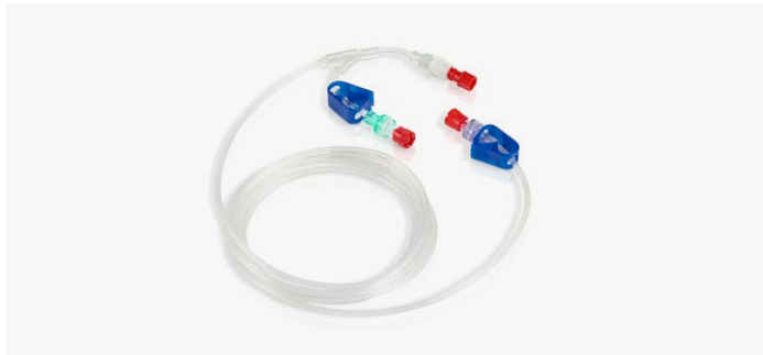
2-way TIVA Set