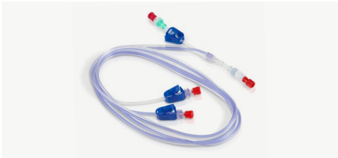
3-way TIVA Set