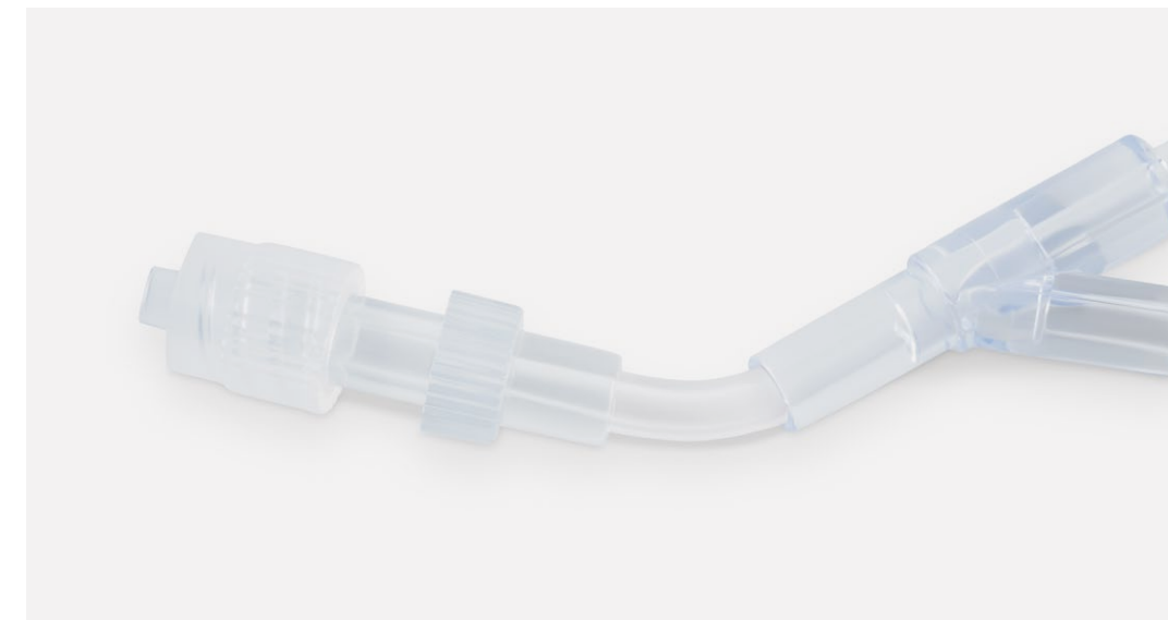
Soft distal end to provide minimal stress at the cannula site