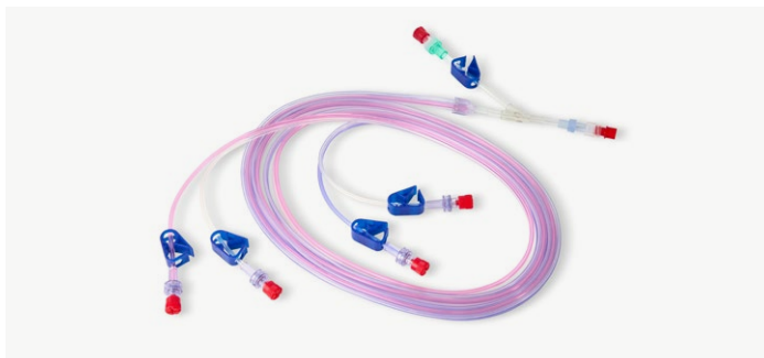
5-way TIVA Set