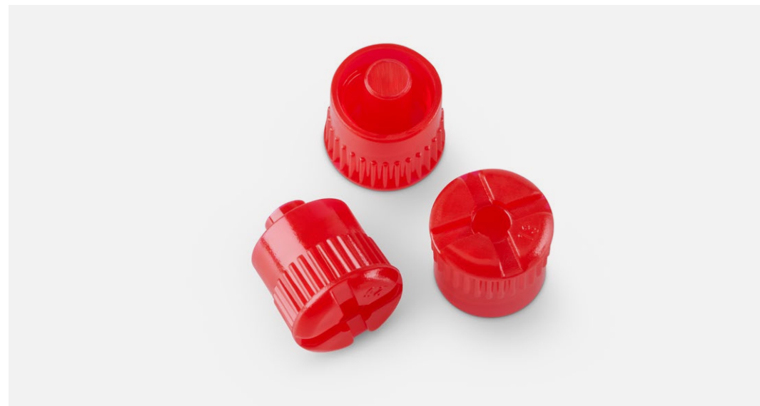
Red end caps always highly visible