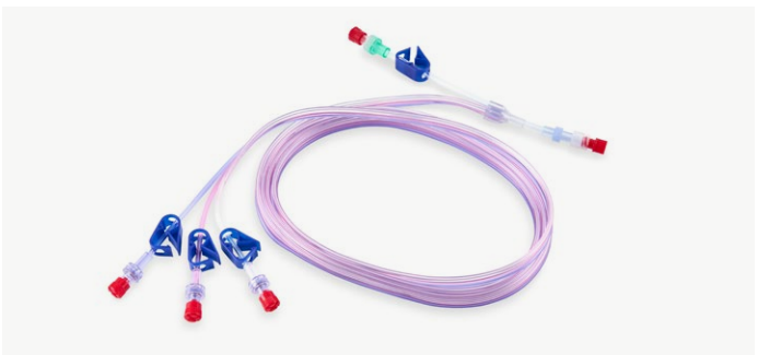
4-way TIVA Set