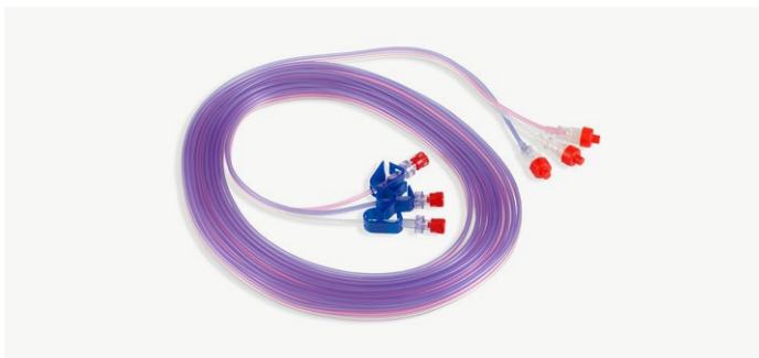
Triple Lumen Extension Set