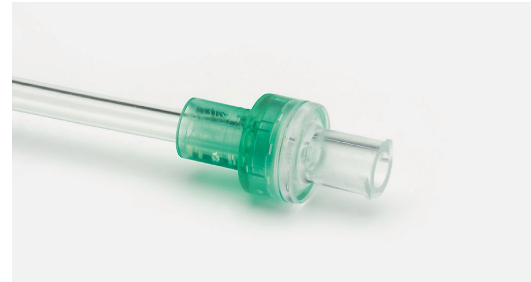
High flow anti-reflux valve to prevent back flow