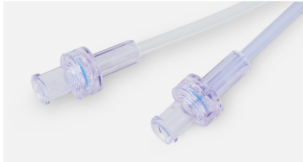
Anti-Siphon valves to prevent back flow and free-flow