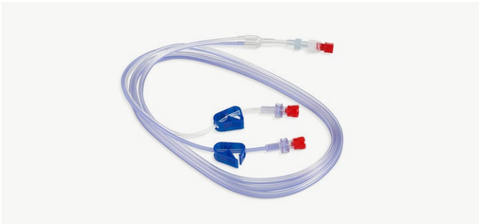
Dual TIVA Set